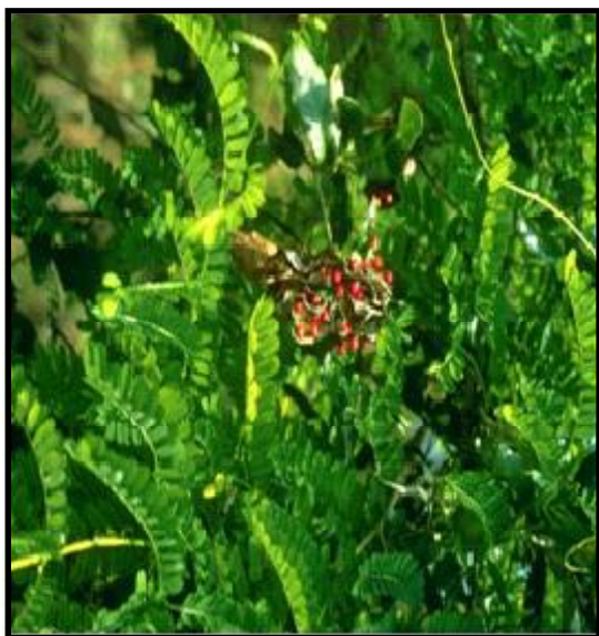
Fig. 1 : Abrus precatorius

The collected herb is commonly called as Abrus precatorius (Gumcchi). Taxonomical position