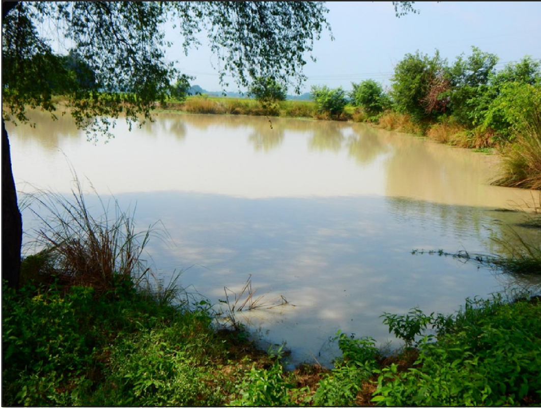
Fig. 2: A view of study area of Muntjibpur pond